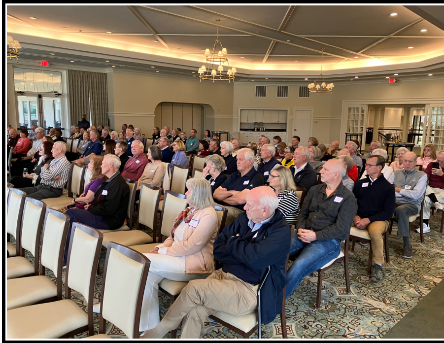
Enjoying the newly renovated PCC Outlook Room